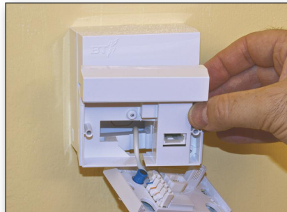
Slide the I-Plate into place by guiding the wiring through the slot at the bottom of the I-Plate. The I-Plate fits onto the back plate just like the faceplate you have just removed.