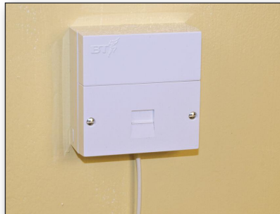
The I-Plate only fits onto the BT NTE5 type master telephone socket shown above - Note the split face plate and BT Logo. *See important notices on reverse side of this page