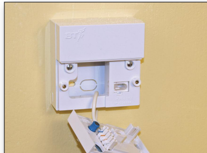
Be careful not to disconnect the wiring attached to the back of the face plate.