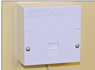
This one has an Openreach logo, not a BT logo

DO NOT ATTEMPT TO INSTALL AN I-PLATE ON THESE SOCKET TYPES, OR ANY OTHER TYPE OF SOCKET EXCEPT THE BT NTE5 SOCKET SHOWN OVERLEAF