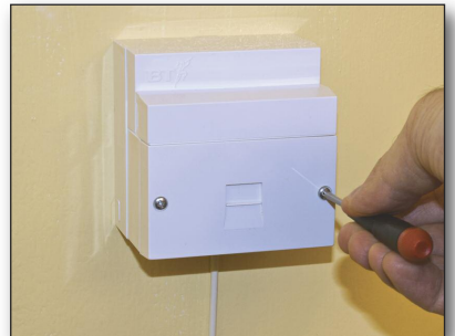
Replace the original face plate over the I-Plate, and use the longer screws provided to secure it in place.