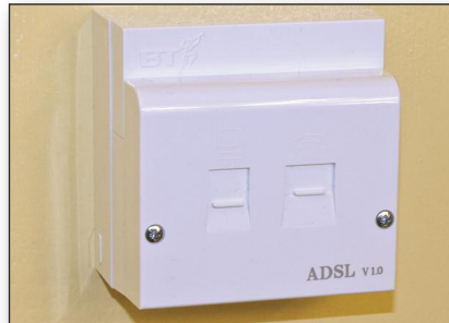
This one has no split in the face plate and has 2 sockets