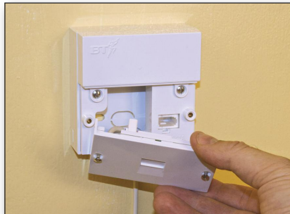
Unscrew and gently remove lower half of the face plate.